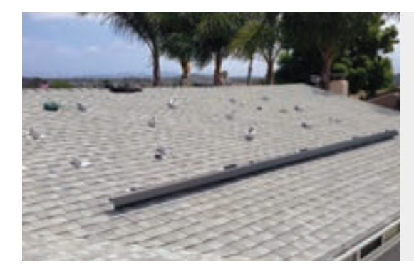
By eliminating rails, installation is fast and less labor-intensive. The installation process is mounts-to-modules, instead of mounts-torails-to-modules, saving you time and money.