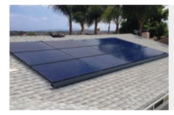
Works with standard modules. Simply drop in the modules, tighten down the clamps, and you have a sleek, attractive solar arrayand that means more referrals from happy homeowners.