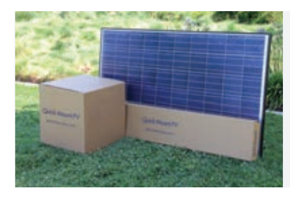
A 5kW system with all required components ships in a few boxes. No long rails means less warehouse space is needed and more install jobs can fit on a single truck. Fewer boxes means it's fast and easy to get materials on the roof, ready to install.